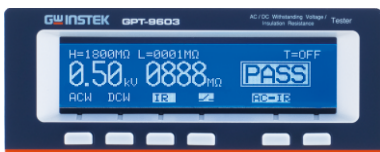
Large LCD, High Intensity Indicators and Function Keys

The 240 x 48 display clearly shows the applied voltage, test parameters, test conditions, measurement value and result on the screen at the same time. The real-time status update on the LCD display accompanied by the multi-colored LED status indicators on the front panel allow operators to have a full control of the test process to perform precision test and avoid unnecessary operation risks at the same time. The status indicator above the high voltage output terminal will automatically flash when an output is in place. In addition, the function keys arranged below the LCD display provide convenient operation that test functions can be easily changed by a single pressing.